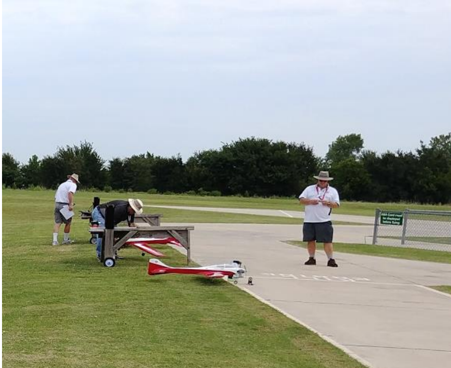
It's showtime for this Dirty Birdie.