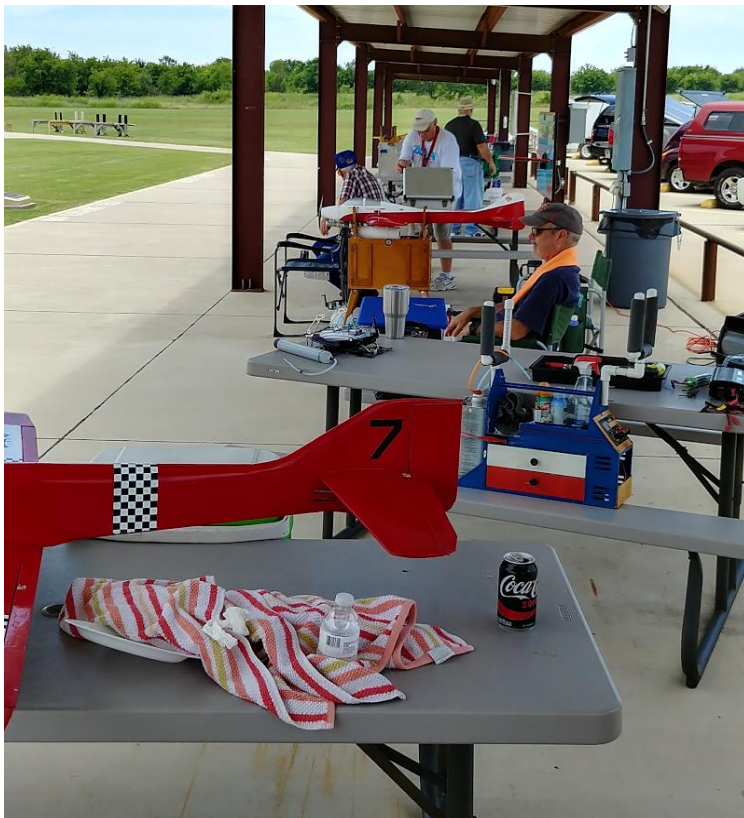
Despite the light turnout, every table was full of airplanes and accessories, including this Curare.