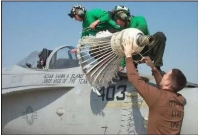
Tell the Admiral we found the 'Birdie' from his Bad mitten Set