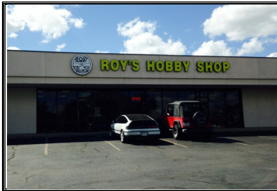
Roy's Hobby Shop 817 268-0210 1309 Norwood Dr. Hurst TX 76053 www.royshobby.com