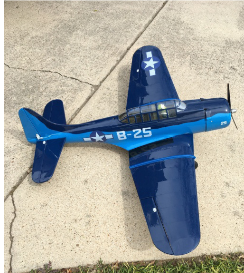
Mel's Seagull Models 'Dauntless. Electric powered with retracts.