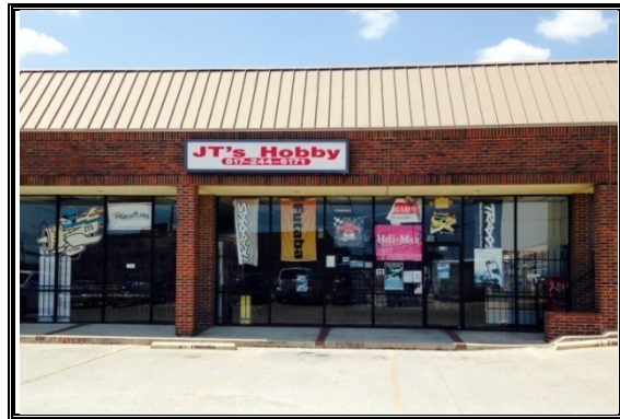
JT's Hobby Shop 817 244-6171 8808 Camp Bowie Blvd. Fort Worth TX 76116 jtshobby@yahoo.com