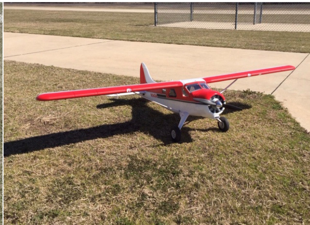
Woody and his FMS Beaver. Electric powered 4000mAh 6 cell battery. Two flights and when asked how it flies, he responded, "like a J-3 Cub with a radial up front."