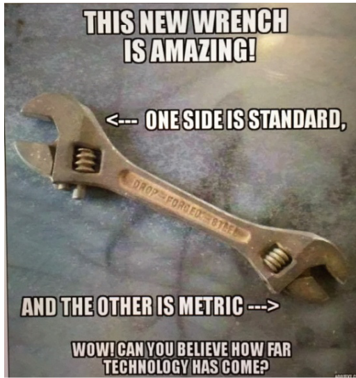
A must have tool for every modeler